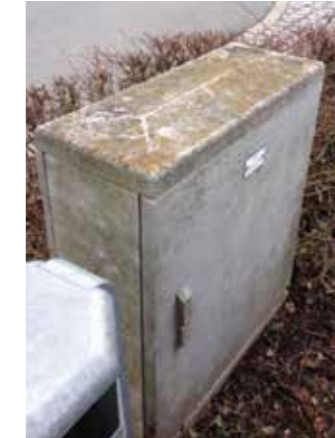
“Blooming” and heavy contamination after several years

No additional separating agent is required for the demoulding. The coating system is environmentally friendly, solvent-free and styrene-free. Additional handling and logistical effort – for the internal coating system, for example, or for an external contract coater – is no longer necessary.