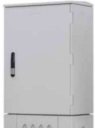
Continuous protection of the SMC components due to PIMC coating