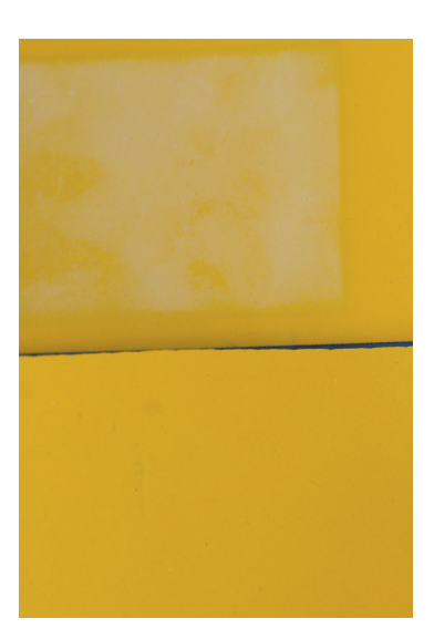
Comparison of UV stability. Polyurea gel coat (bottom) and conventional UP gel coat (top). The new gel coat shows virtually no optical change after 500 hours of